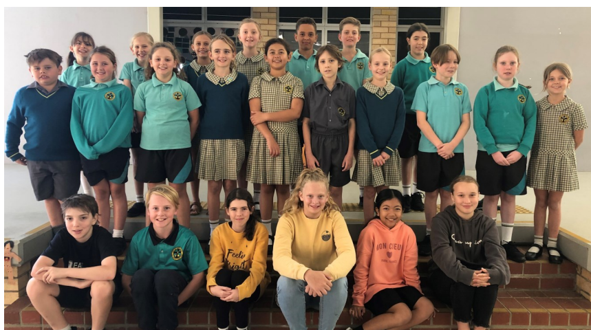
Above: Merit Certificate award recipients for Yr 3—Yr 6.