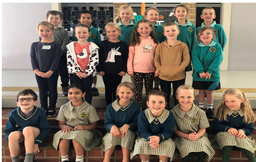
Above: Merit Certificate award recipients for Class PP—Yr 2.