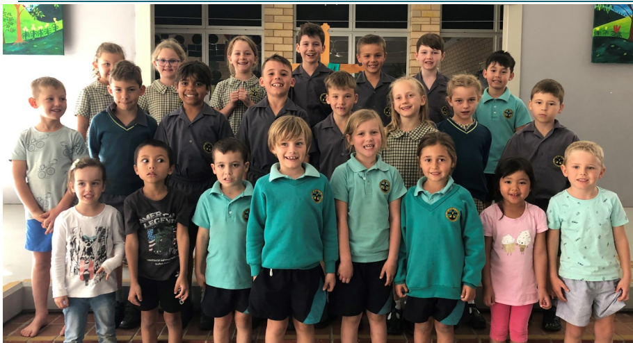
Above: Merit Certificate award recipients for Class PP—Yr 3.