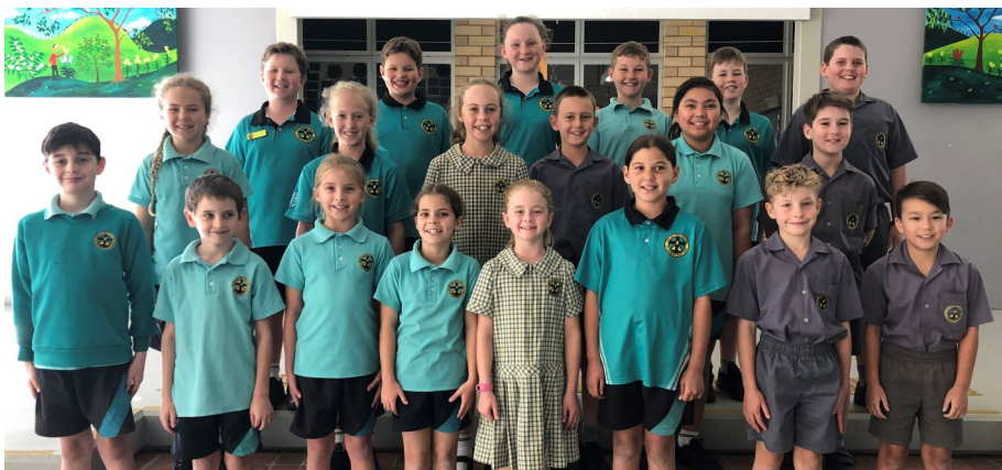
Above: Merit Certificate award recipients for Yr 4—Yr 6.