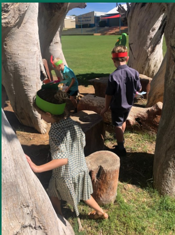
Easter Egg Hunt with the Kindy / Year 1 students